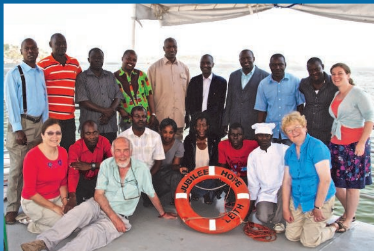
Our first team of volunteers with the Tanzanian staff aboard Jubilee Hope

The support provided by these volunteers, sharing from their experience and knowledge and working shoulder to shoulder with the Peruvian team, has been an incredible encouragement to all involved, as well as a great example of selflessness, generosity, teamwork and dedication. And the impact goes further still. The participation of Vine Trust volunteers has also developed the programme through the equipping, capacity building and training of the local staff. Furthermore, innovative activities, such as ophthalmic surgery campaigns which were initially led by overseas volunteers,