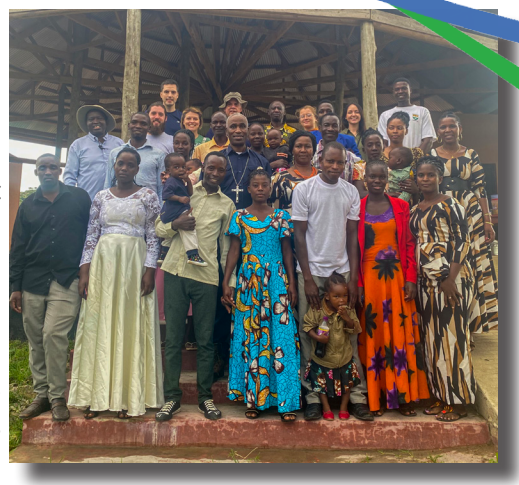
A real sense of community has developed amongst the foster parents and the children since moving into Kazunzu Village of Hope.

We are also seeking support for solar panels for the village school along with solar batteries for computing and wider community benefit and, of course, equipment for the vocational training