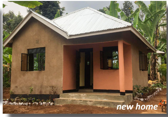
A transformational gift of a new home during 2022 for a widow and her 8 young children was possible through Vine Trust's partnership with TAWREF