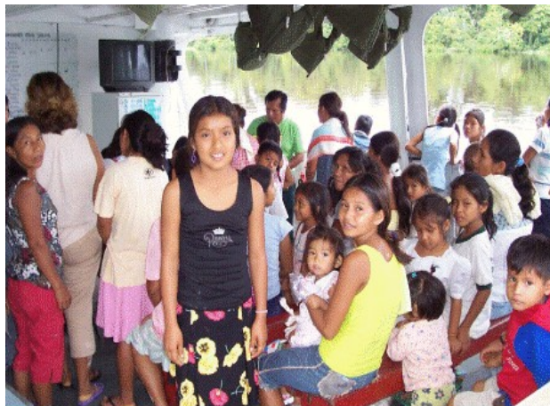
The patients waiting area onboard Amazon Hope 1