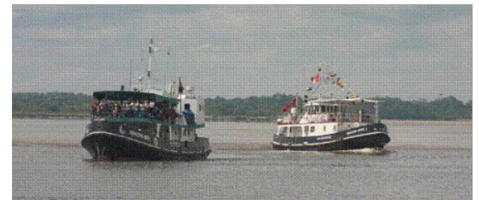
Amazon Hope 1 and 2 on the Amazon River

In addition to marine work party costs, team members are encouraged to help raise funds for project development in Peru. An information and ideas sheet will be sent with your application pack.