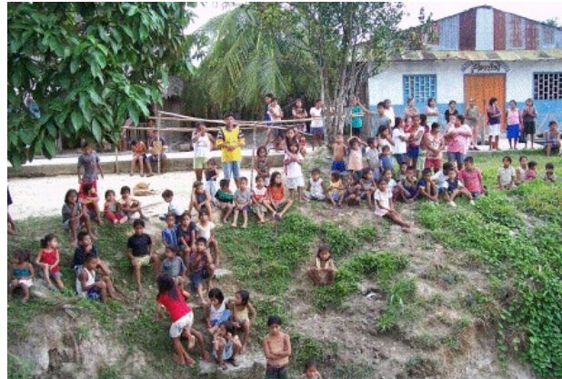
Waiting on the banks of the village for Amazon Hope to Arrive

The Vine Trust supports projects in developing countries and is partnering Scripture Union Peru with the development of a medical project to deliver a health care service for up to 100,000 people in the Peruvian Amazon. Key to this strategy is our medical ships, the Amazon Hope 1 and 2 which can access remote communities in the region. Join us on a trip of a lifetime to bring hope to the people of the Peruvian Amazon by spending two weeks working with Scripture Union Peru on the maintenance of the Amazon Hope ships.