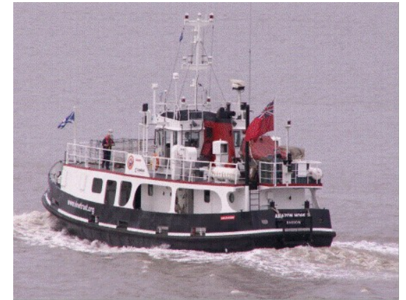
Amazon Hope 2 departing from the UK for Iquitos, Peru

Volunteers are asked to arrange insurance cover directly with Banner Group insurance. This also adds to the trip costs.