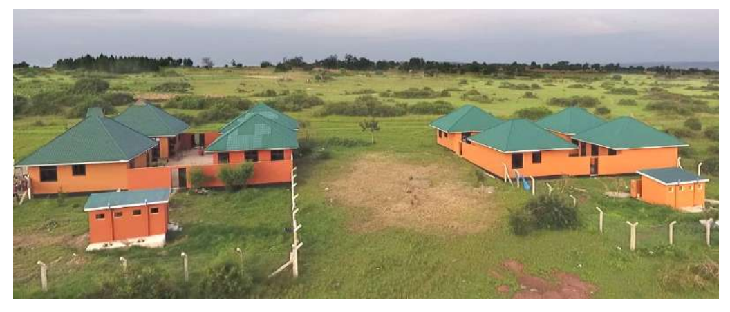
The first 8 homes at Kazunzu have now been built and families have moved in.

These 8 houses are home to 34 orphaned children, having been identified by the church (AICT) in partnership with local community leaders and social services. Reports from the residents reveal that, since moving into their new homes, a real sense of community has been developed at Kazunzu.