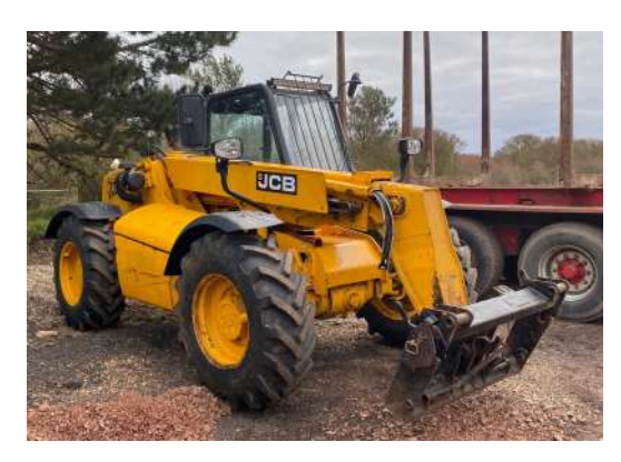
The Lorry & Tele-handler donated to the Kazunzu Village of Hope