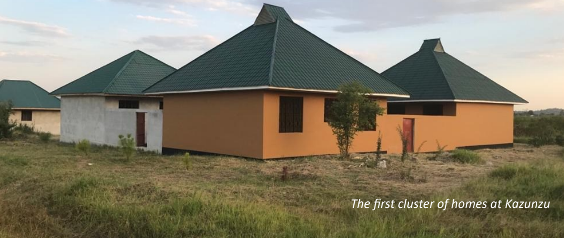
The first cluster of homes at Kazunzu

Fish farm cages are also under construction to establish the Kazunzu Fisheries Project which will be a key component in making the village self-sustaining. A drilling rig is about to resume drilling to provide water for the site. Failing that, a pump storage and water treatment system will be installed using lake water.