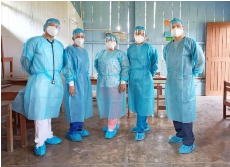
The Amazon Hope Medical Team, ready to receive their first patients upon recommencing expeditions to the communities

Although there is still great uncertainty about what the coming weeks and months hold for the medical programme in Peru, there remains a passion and commitment from all to work alongside the numerous remote communities in ensuring access to vital medical services for all residents.