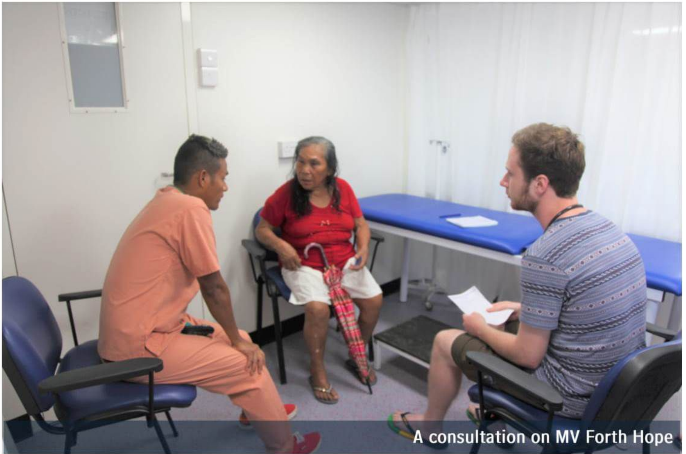
A consultation on MV Forth Hope

“I have been able to use my medical experience to help others which has been a real privilege. I think I have grown as a person - more flexible and able to problem solve. I really value the ethos and professionalism of the programme”.