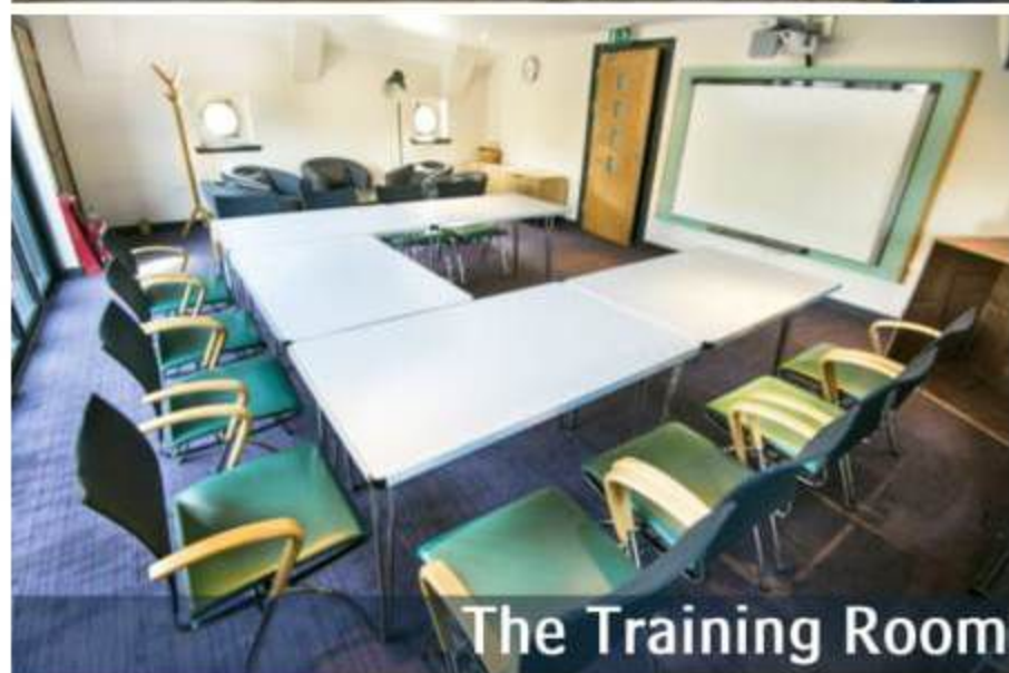
The Training Room

Glass Room: On the top deck, with floor to ceiling windows and almost 360 degree views, the Glass Room is our most versatile space. Sit down dinner for 50, conference for 70, a wedding!?! No problem!