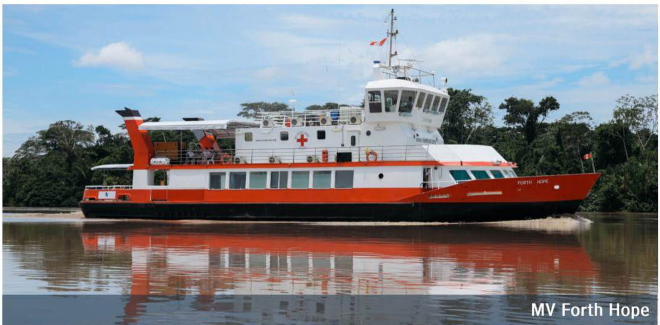
MV Forth Hope

Since its arrival, the MV Forth Hope has been working alongside the MV Amazon Hope 2 to visit 5 different river basins over the past 12 months. The extra capacity for service provision has allowed the programme to visit new communities and zones previously unreachable by the ships, with an estimated 170,000 consultations being provided in 2018, growing to 200,000 per year from 2019.