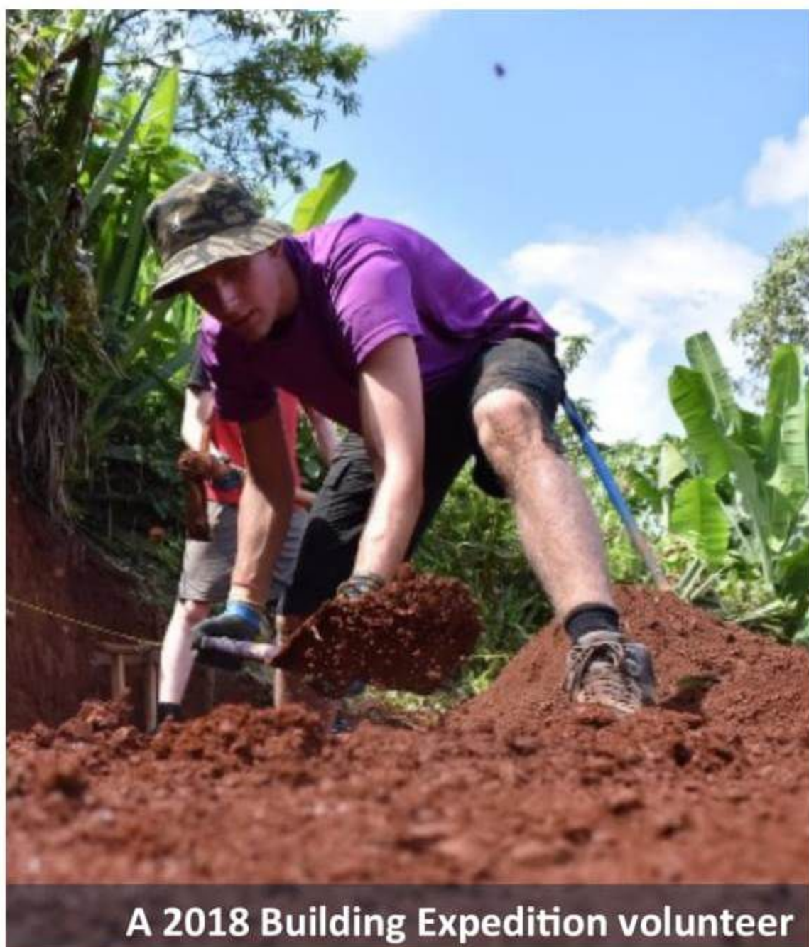
A 2018 Building Expedition volunteer

Would you like to support us in providing further individual family homes for orphans and vulnerable families in Moshi? Or be part of the exciting new developments on the shores of Lake Victoria at Kazunzu, Village of Hope? Join one of our expedition dates below to join other like-minded volunteers: