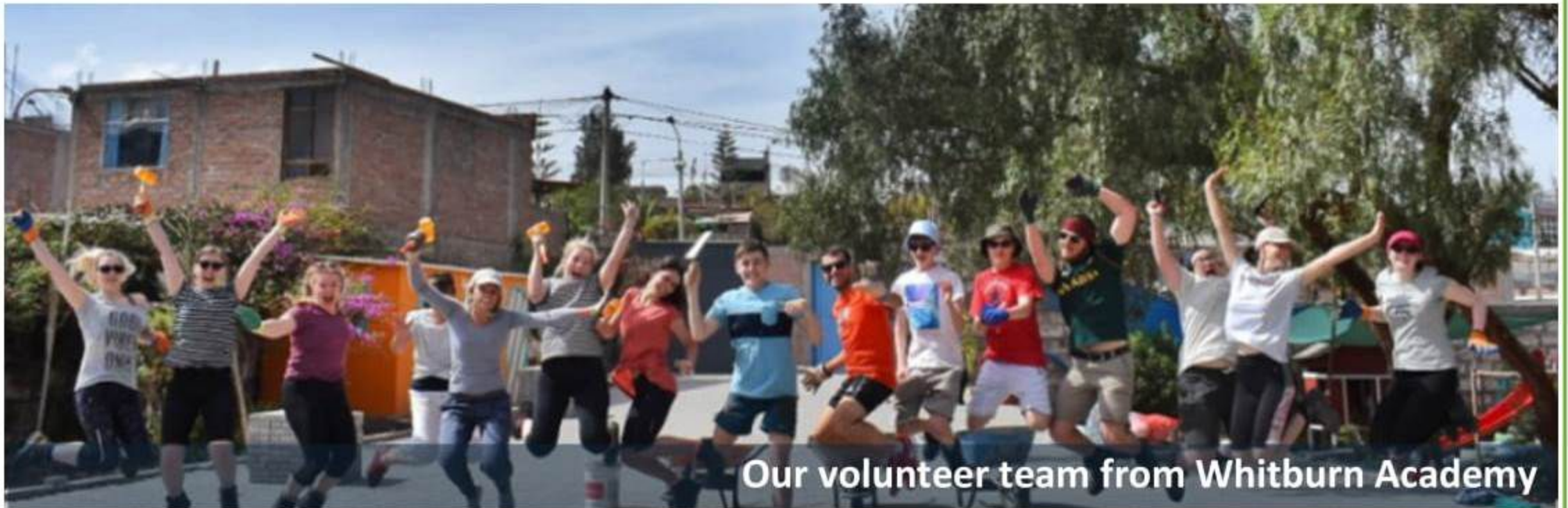
Our volunteer team from Whitburn Academy

In 2018, social media at times has received a somewhat “bad reputation”. However, it can also be a tool for empowerment and a great way to tell our stories. We handed our website blogs over to our school volunteers on Building Expeditions this summer during their time in Tanzania and Peru, and were blown away by their reflections: