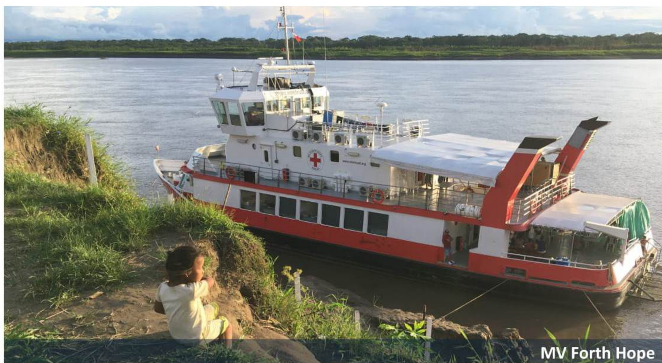
MV Forth Hope