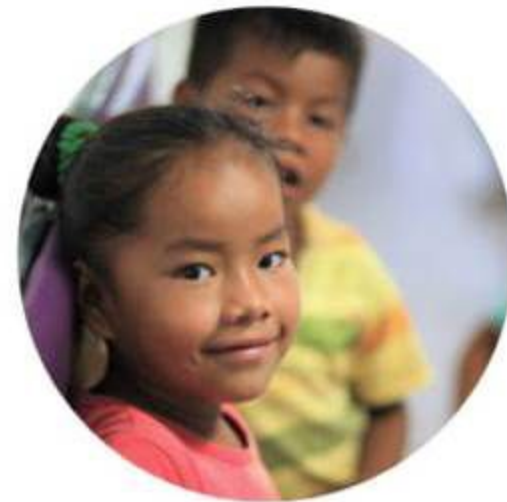
Reaching Remote Communities