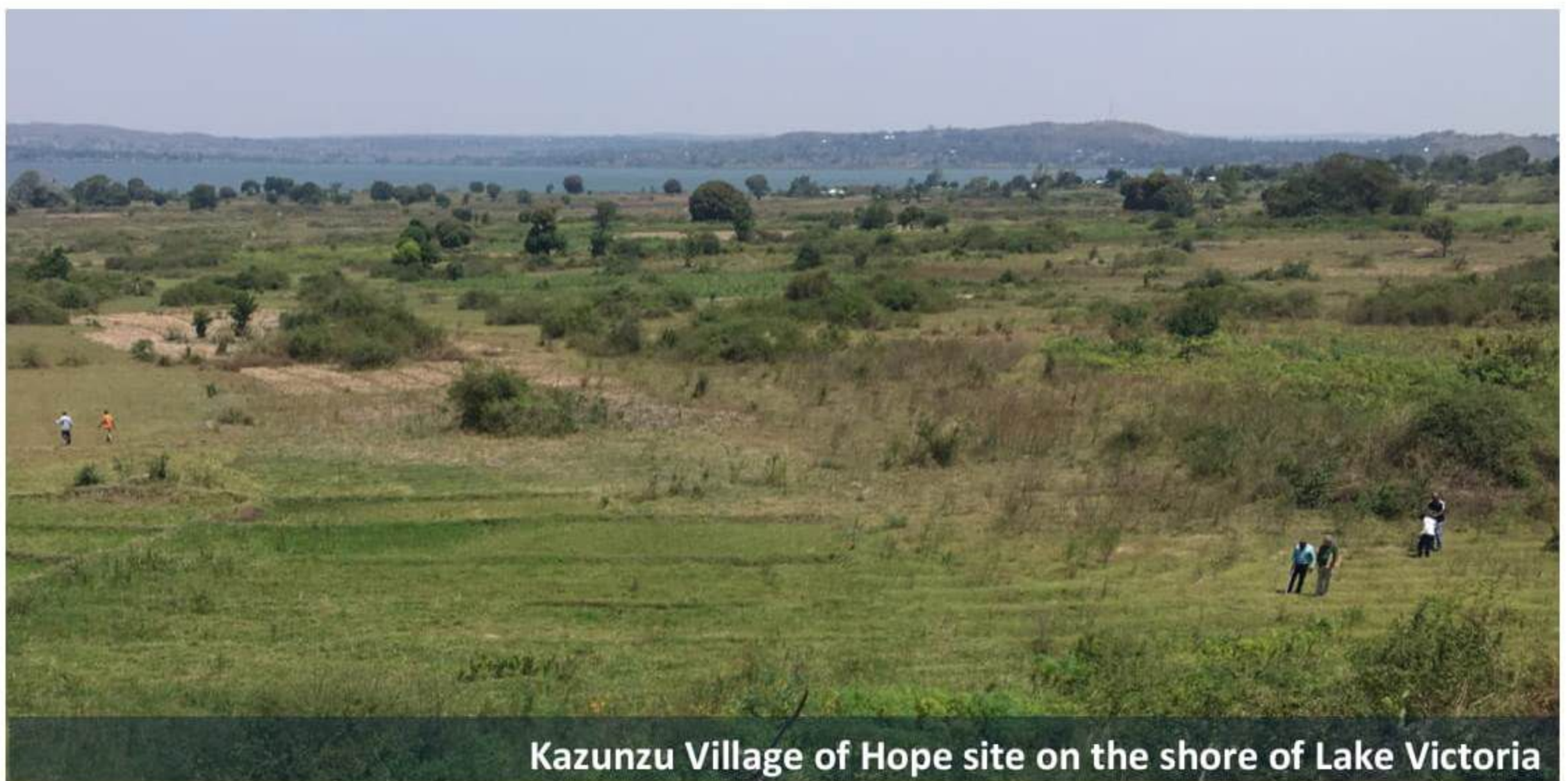
Kazunzu Village of Hope site on the shore of Lake Victoria

Sustainability will be key to the success of such a programme and we hope to create an array of income opportunities for the villagers. There will be an area of land set aside for farming cash crops, and we also plan to create a series of fish ponds where the villagers can farm Tilapia, a lucrative fish commonly found in Lake Victoria, which can be more effectively and safely farmed in small ponds. Crafts, income from the Vocational Training Centre and school fees all have the potential to expand the income for villagers.